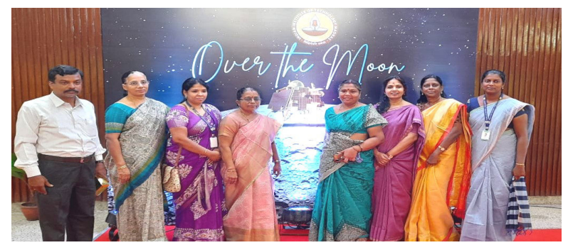
October 11, 2023 XI CLASS COMMUNITY LUNCH

During the session, an enlightening video about the making of Chandrayan-3 was presented, aiming to raise awareness about aerospace mechanical engineering among the students. The video captivated the audience, providing them with valuable insights into this fascinating field of study.