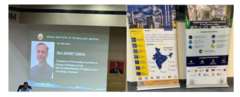
October 7, 2023 WORLD TEACHERS' DAY VIRTUAL WEBINAR

The meeting concluded with a unanimous consensus that equipping the younger generation with knowledge and skills related to sustainability is indispensable. Participants firmly believed that the potential of young minds to catalyze substantial change and innovation within the realm of sustainability cannot be underestimated.