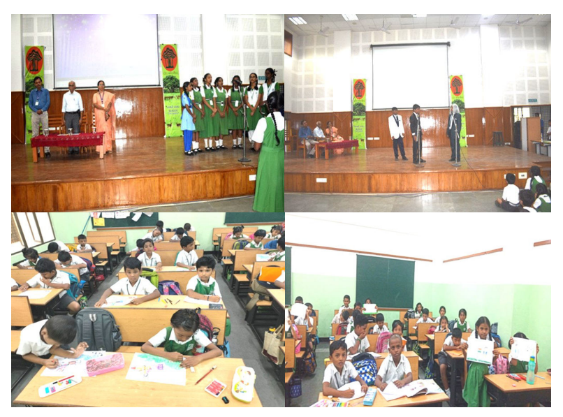
October 14, 2023 OPEN DAY

Open day was conducted from classes I to XII.